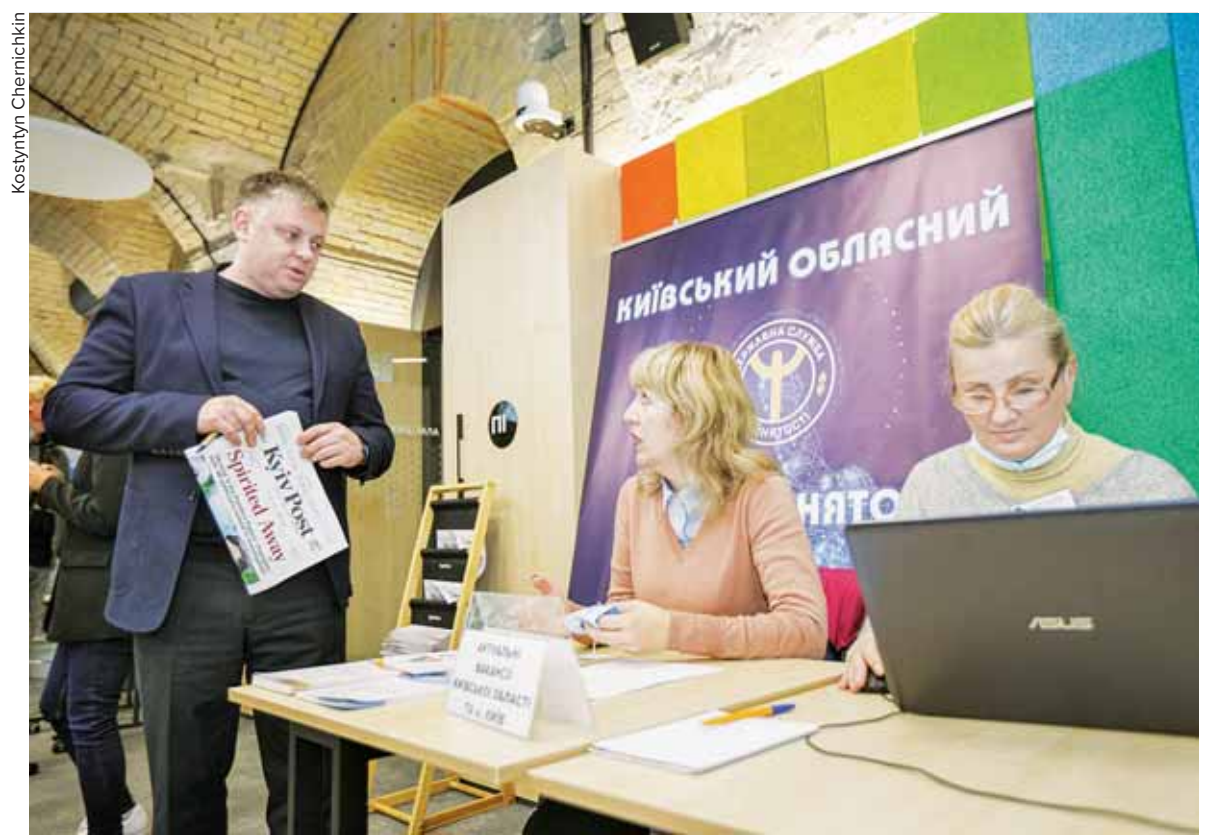
Representatives of the Employment center of Kyiv oblast speak with visitor during the Kyiv Post Employment Fair at the Osvitoria Hub in Kyiv on Oct. 7, 2021.

Some of the vacancies promoted at the fair included financial analyst positions with the National Bank of Ukraine, vacancies at Kyiv's Premier Palace Hotel, graduate legal careers at Golaw, and contract work with