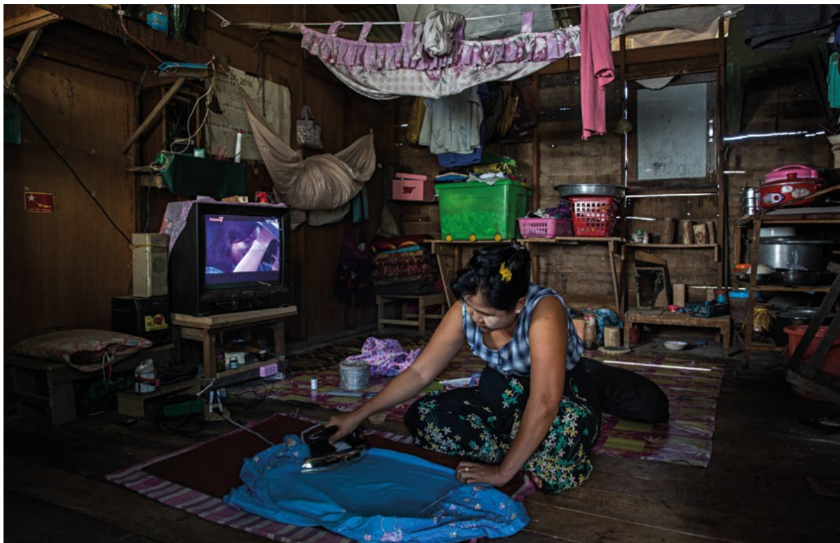
A woman irons clothes in her home.

Employers should, as a standard practice, conduct thorough age checks when hiring workers by checking their documents (NRC, township registration or birth certificate) and requiring a medical check. Young workers of 16-18 years old can only be employed with a valid CoF. Employers should be aware of unqualified medical bodies issuing forged certificates and NRCs. The employer should cover costs of CoF examinations. Buying companies, in turn, should be aware of their suppliers' administration and records being peppered with falsified documents.