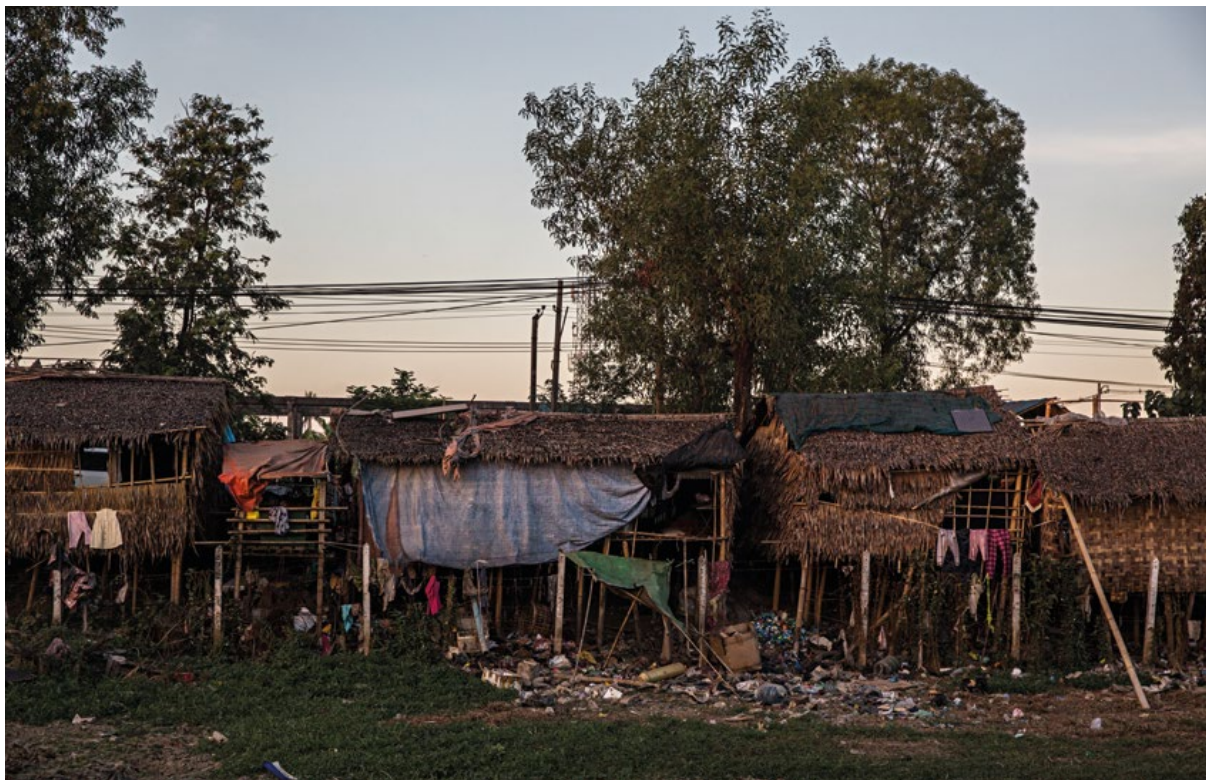
Squatter area for garment factory workers.

include risks related to land grabbing, questionable ownership and military influence, the powerful presence of foreign-owned garment factories, child labour and the position of ethnic workers.