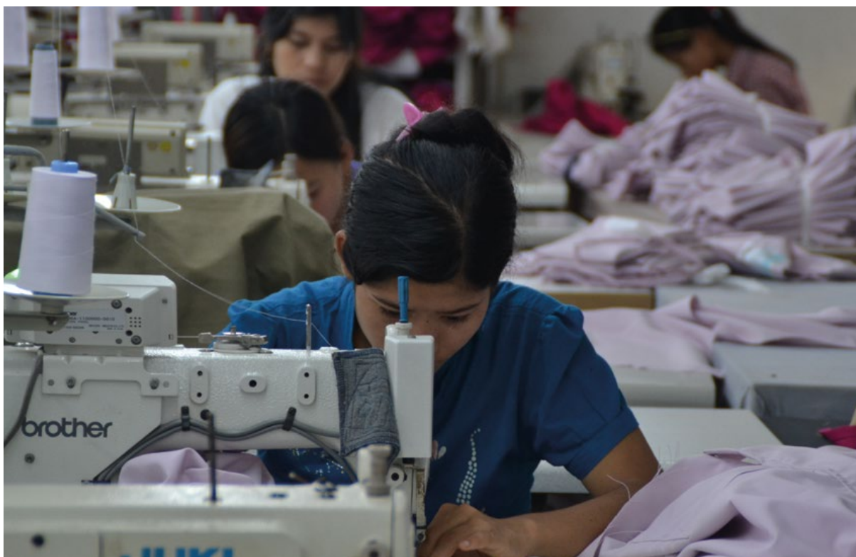
A garment factory in Myanmar (this factory was not included in the research).

They provide a mediation and conciliation platform for resolving practical issues that may arise with the implementation of the Guidelines. 88