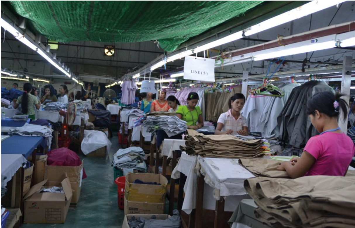
A garment factory in Myanmar (this factory was not included in the research).