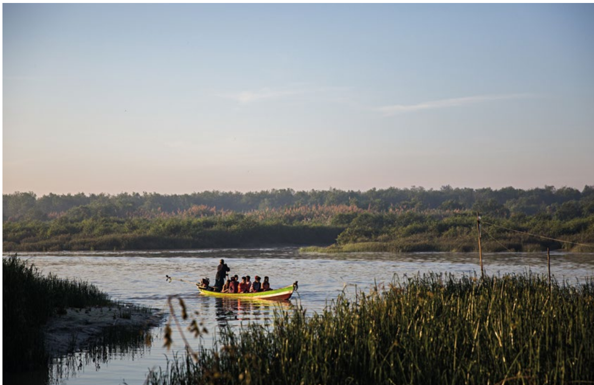
Garment factory workers travel by boat to work in the morning from a small village across the canal. Lauren DeCicca | MAKMENDE

supplier list mentioned a number of factory names that no longer appear on the December 2016 version. According to C&A, one of the factories could not meet C&A's delivery deadlines. At two other factories, production was suspended due to poor audit results.