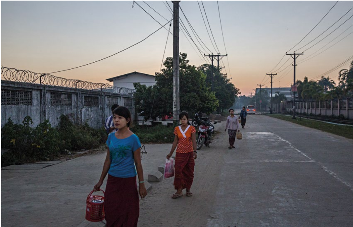
Garment factory workers walk to the factory in the early morning before work.

Reaction to factory findings: Deuter wrote to SOMO that it does not source from Factory 5 but from this unit. This unit and Factory 5 are part of the same company. The two factories are located at the same premises and fall under another unit of the same company. Both factories have been audited by FWF in May 2016. Deuter wrote that the results of the May 2016 FWF audit did not substantiate the working conditions as described by SOMO. Deuter wrote that the SOMO's findings regarding the employment of young workers were not confirmed by the audit. The youngest worker found during the audit was 18 years old. In its Social Report 2015 (reporting period July 2015-June 2016), Deuter summarised the results of the audit.