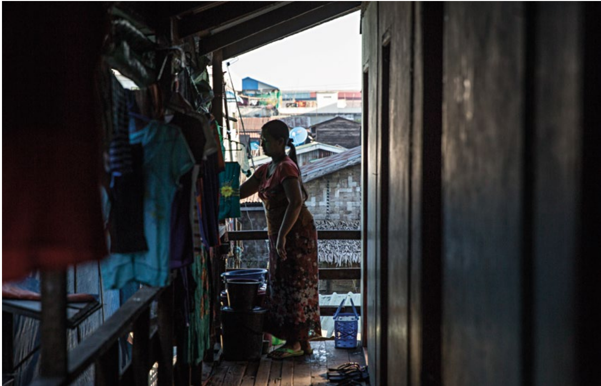
A garment factory worker hangs clothes out to dry at her dormitory in Yangon, Myanmar.

In May 2010, FWF adopted a formal position on Myanmar. At that time FWF was of the opinion that the situation in Myanmar was such that there was insufficient foundation for a credible process that could lead to improvements in working conditions in factories and that there was no credible structure for strengthening social dialogue between local stakeholders. Consequently, FWF required members and prospective members to phase out production at factories in Myanmar. 241