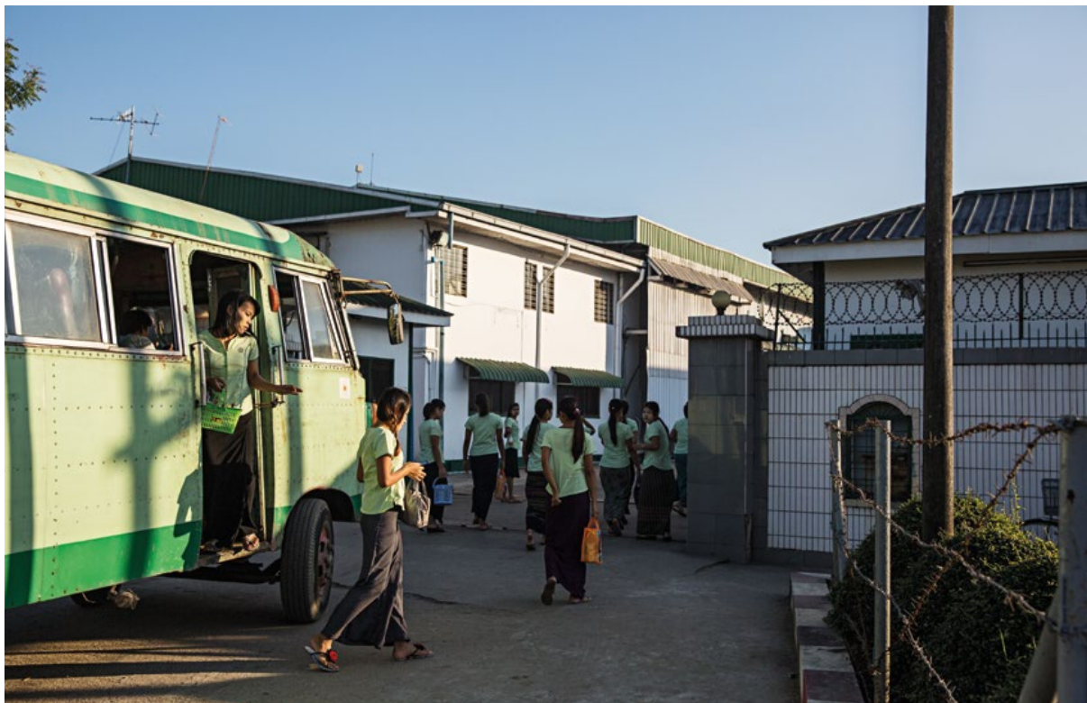
A shuttle bus drops off workers..