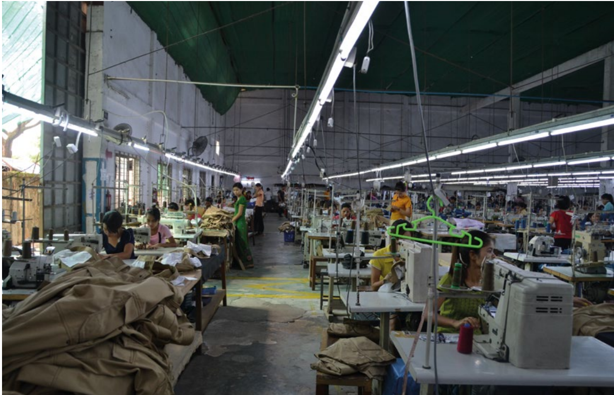
A garment factory in Myanmar (this factory was not included in the research).

Daily labourers were found to be among the workforce at four of the 12 investigated factories. Daily labourers do not sign contracts; they only receive the basic daily wage, which may be below the minimum wage of 3,600 kyat (€2.48) per day; they are not eligible for bonuses and benefits; and they are not covered by the social security system. In addition, daily labourers have very insecure jobs as in the absence of a formal employment relationship they are easily dismissed.