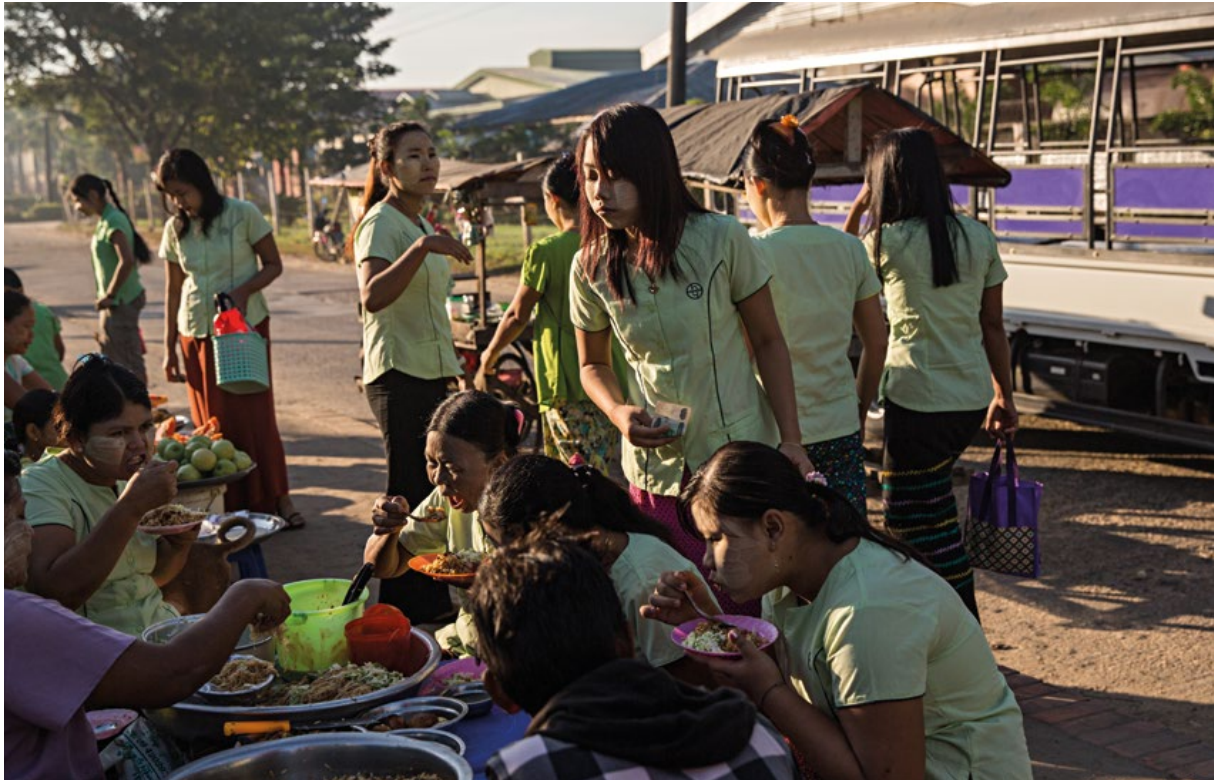
Garment workers eat breakfast at a small stand.