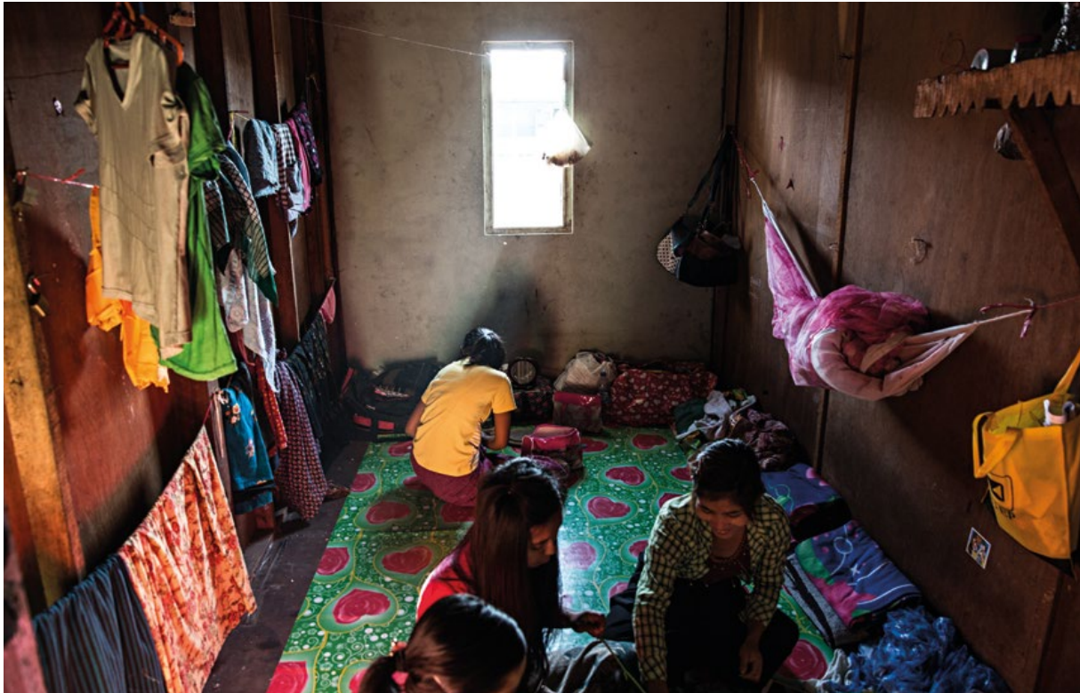
Garment factory workers prepare food in their small dormitory room in Yangon, Myanmar.