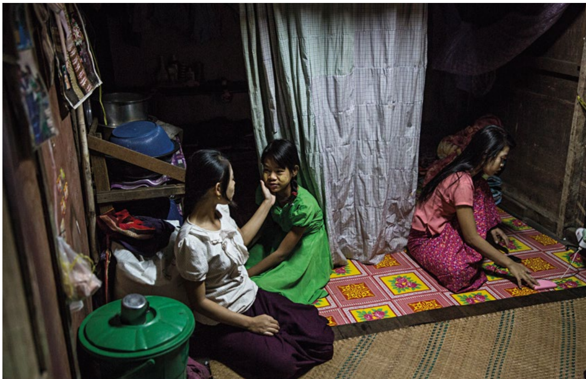
Garment factory workers sit in their home at the end of their work day.

The legal minimum wage applies across the country and across sectors and industries, but with the following exemptions: