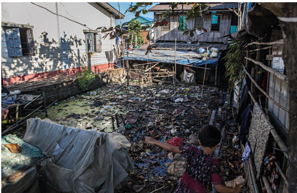
A young girl walks into her home, where many garment factory workers live. The area is full of trash and is flooded with dirty water.

and human rights risks, unless expressly stated. 60 The SIA final report expected the textile sector “to derive net positive gains from an EU-Myanmar IPA in all sustainability issue-areas.” 61