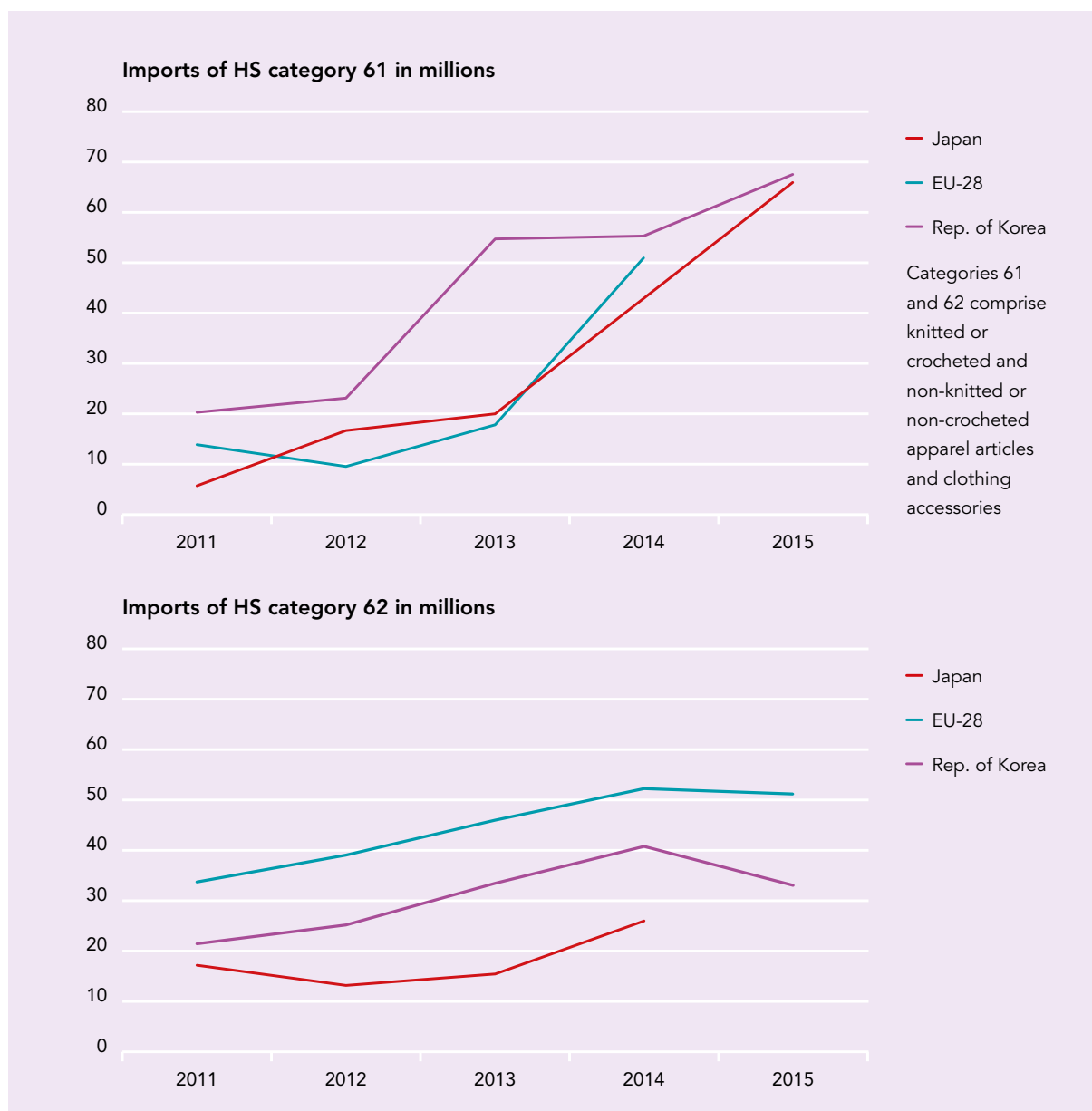
Figure 1 Imports of HS category 61 and 62 from Myanmar

133