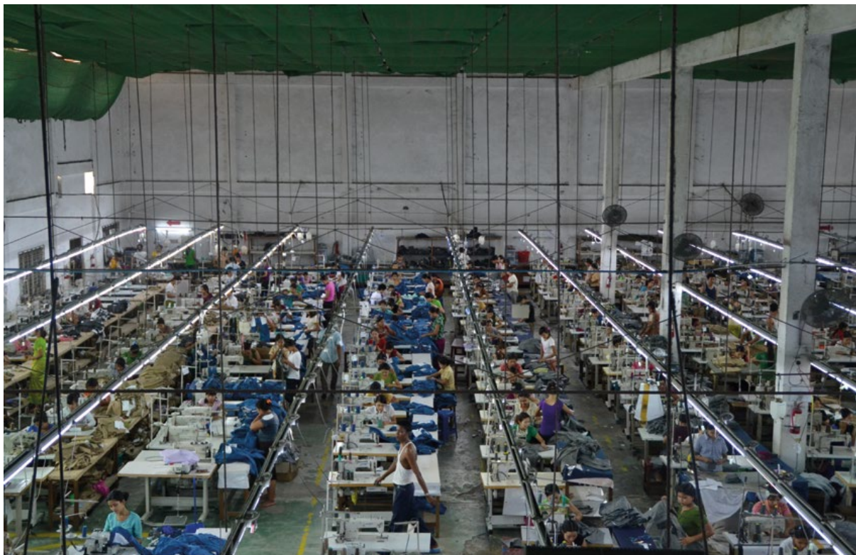
A garment factory in Myanmar (this factory was not included in the research).

and dispute settlement and the presence of labour unions and CSOs, the SEZs have special rules. Human rights and labour rights are not necessarily well served in these zones.