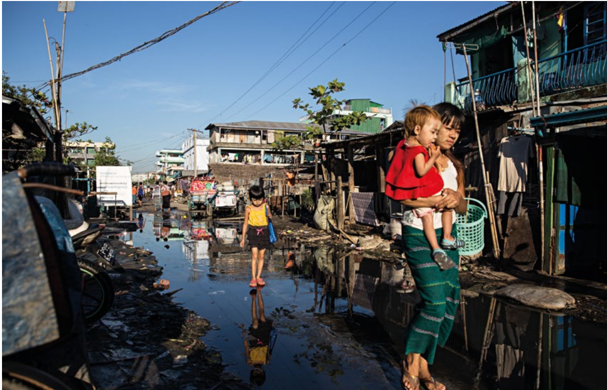
A woman and children walk down the flooded streets of Yangon's Hlaing Tharyar industrial Zone, an area that houses many garment factory workers.

Moreover, the current administration relies heavily on civil servants who served under the previous government – including, for example, the Director General and the Secretary of the Ministry of Labour. District and township level dispute handling bodies are also still run by civil servants who have been in post since the days of the military regime.