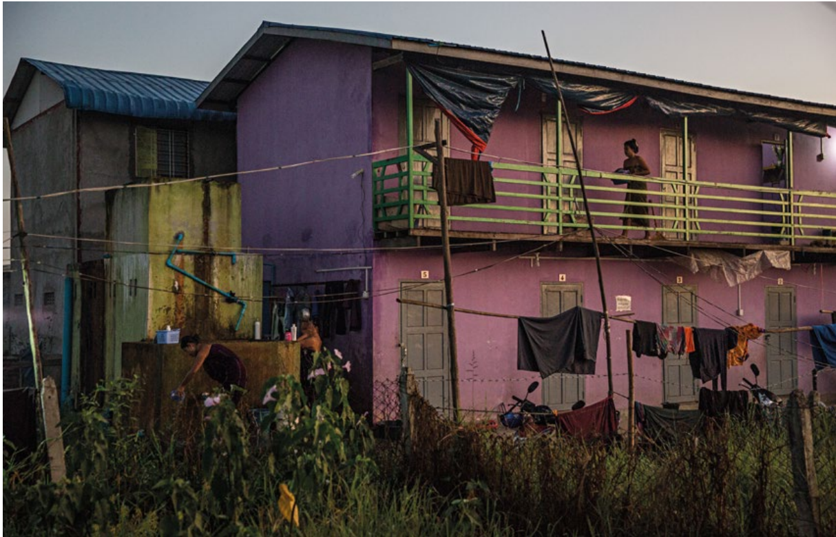
Exterior of a dormitory for garment factory workers.

understanding that the Myanmar labour movement and civil society is in full development; unions and labour NGOs are being established as we speak.