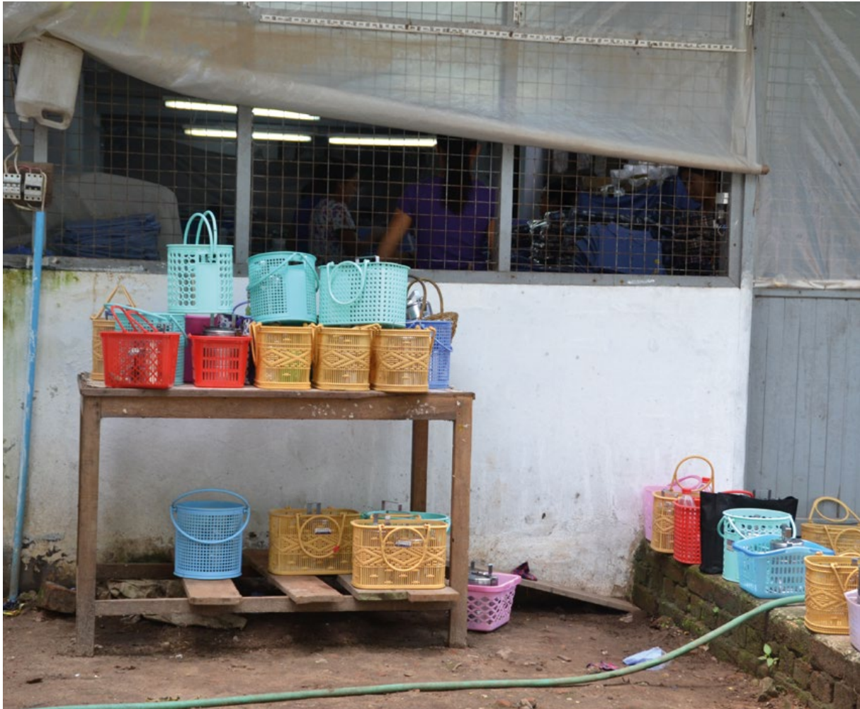
A garment factory in Myanmar (this factory was not included in the research).

At Factory 5, more than half of the interviewed workers were aware about trade union rights, as they had been in contact with ALR on different occasions. Some of the interviewed workers said they were interested in forming a trade union.