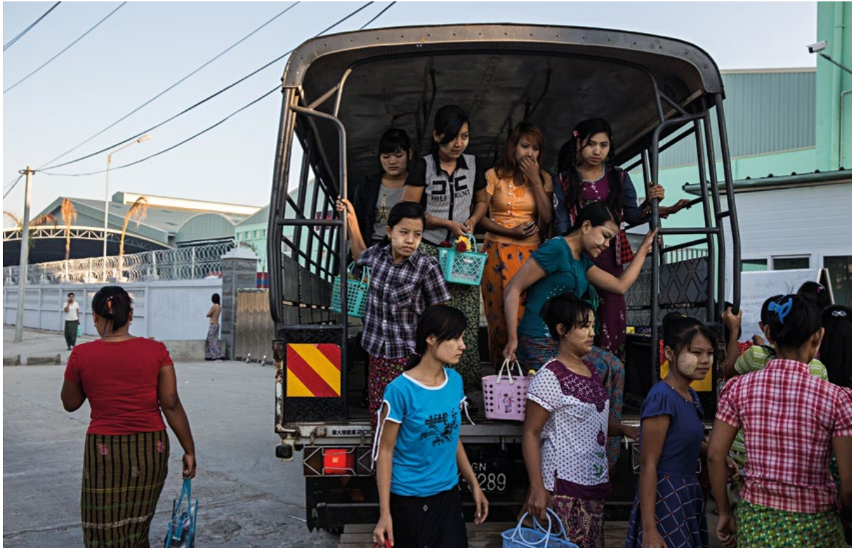
Garment factory workers get dropped off by a shuttle bus service in the morning before work.

The following buying companies did not respond to the review request: Lonsdale, Kawasaki, Hudy, Sports Direct, Erima, Henri Lloyd, Karrimor, Pierre Cardin, Arrow, Bessshirt, Izumifuhaku, K2, and LL & S Purchasing Corp. (The Levy Group).