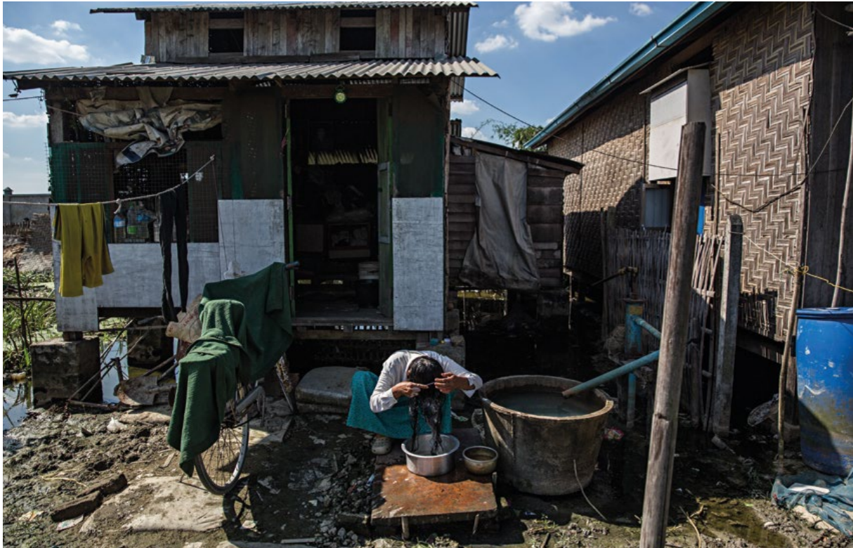
A woman washes her hair outside of her home in a squatter village where many garment factory workers live.