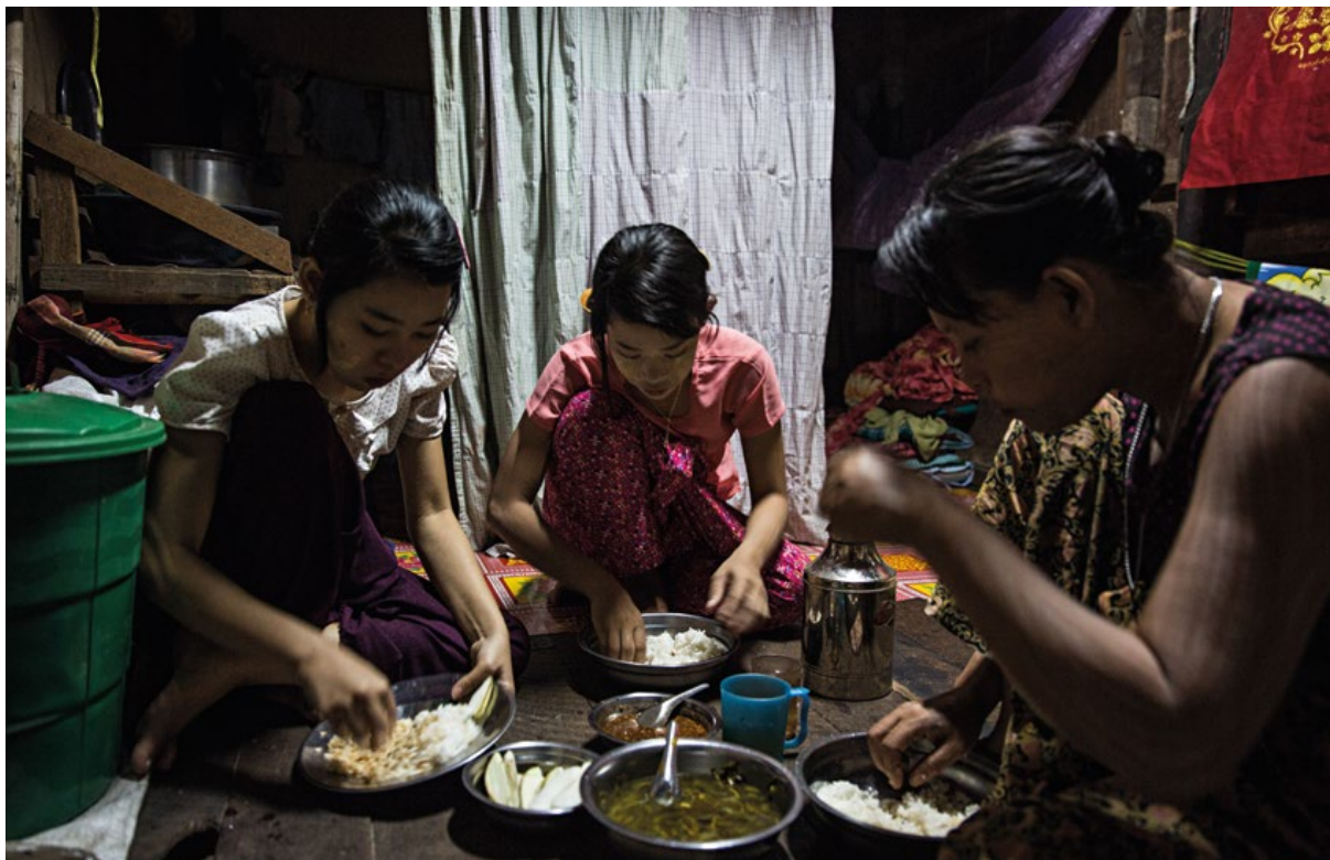
Garment factory workers eat dinner in their small home.