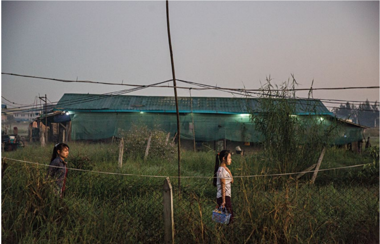
Garment factory workers walk down the footpath near their home on their way to work. Lauren DeCicca