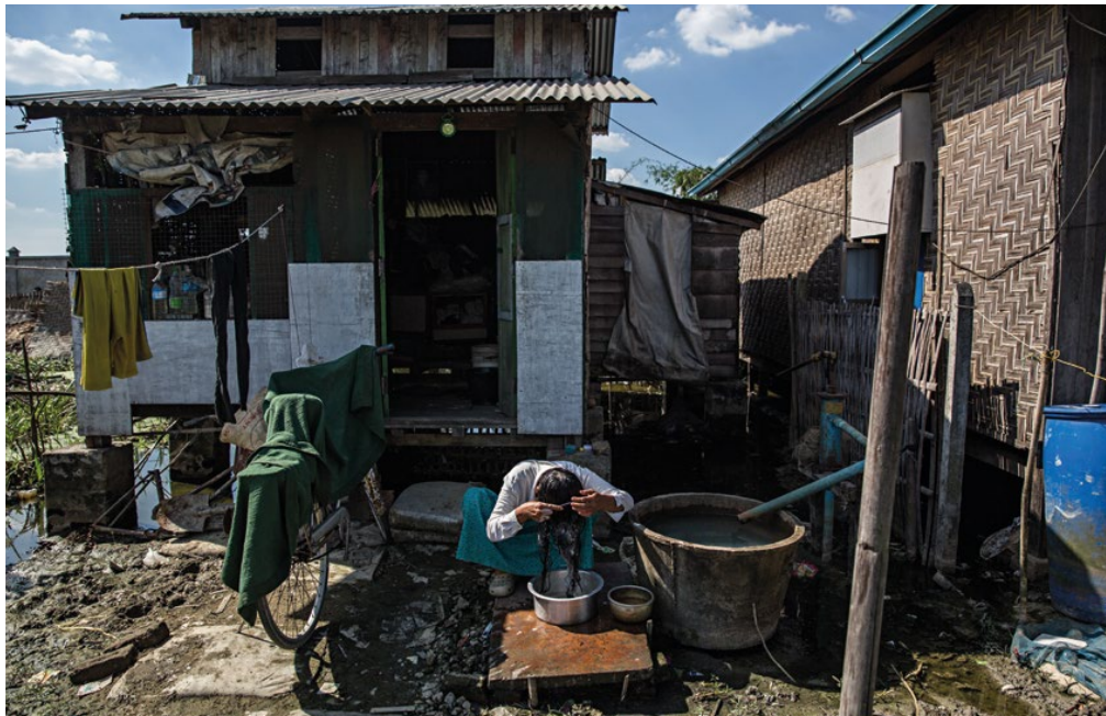
A woman washes her hair outside of her home in a squatter village where many garment factory workers live.