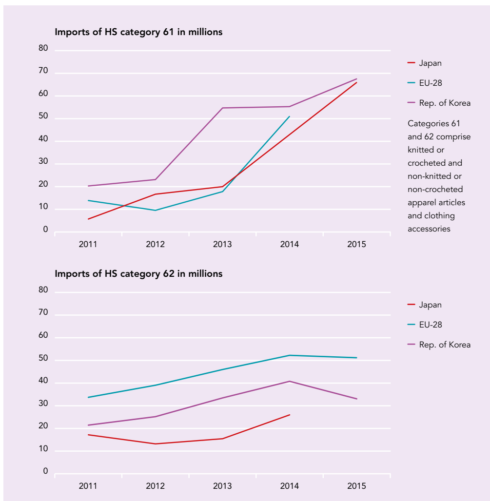
Figure 1 Imports of HS category 61 and 62 from Myanmar

133