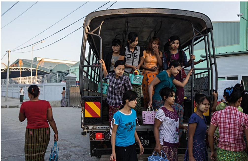
Garment factory workers get dropped off by a shuttle bus service in the morning before work.

The following buying companies did not respond to the review request: Lonsdale, Kawasaki, Hudy, Sports Direct, Erima, Henri Lloyd, Karrimor, Pierre Cardin, Arrow, Bessshirt, Izumifuhaku, K2, and LL & S Purchasing Corp. (The Levy Group).