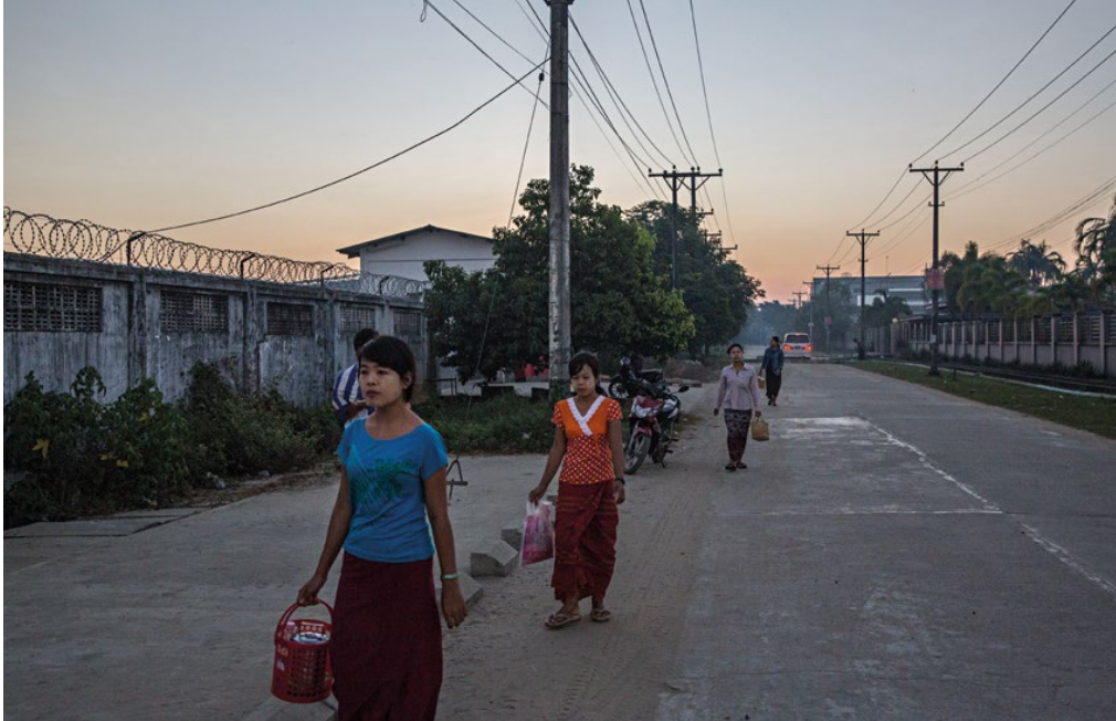
Garment factory workers walk to the factory in the early morning before work.

Reaction to factory findings: Deuter wrote to SOMO that it does not source from Factory 5 but from this unit. This unit and Factory 5 are part of the same company. The two factories are located at the same premises and fall under another unit of the same company. Both factories have been audited by FWF in May 2016. Deuter wrote that the results of the May 2016 FWF audit did not substantiate the working conditions as described by SOMO. Deuter wrote that the SOMO's findings regarding the employment of young workers were not confirmed by the audit. The youngest worker found during the audit was 18 years old. In its Social Report 2015 (reporting period July 2015-June 2016), Deuter summarised the results of the audit.