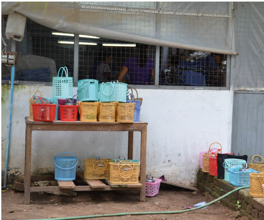
A garment factory in Myanmar (this factory was not included in the research).

At Factory 5, more than half of the interviewed workers were aware about trade union rights, as they had been in contact with ALR on different occasions. Some of the interviewed workers said they were interested in forming a trade union.