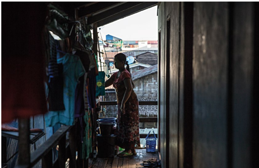
A garment factory worker hangs clothes out to dry at her dormitory in Yangon, Myanmar.

In May 2010, FWF adopted a formal position on Myanmar. At that time FWF was of the opinion that the situation in Myanmar was such that there was insufficient foundation for a credible process that could lead to improvements in working conditions in factories and that there was no credible structure for strengthening social dialogue between local stakeholders. Consequently, FWF required members and prospective members to phase out production at factories in Myanmar. 241