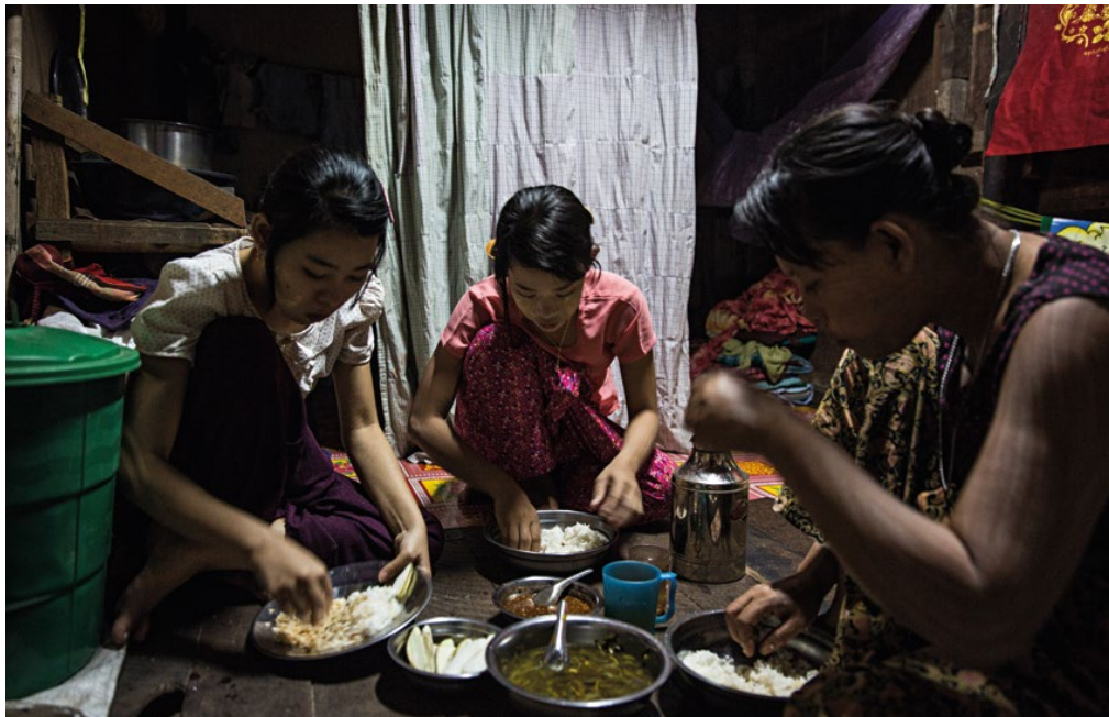
Garment factory workers eat dinner in their small home.