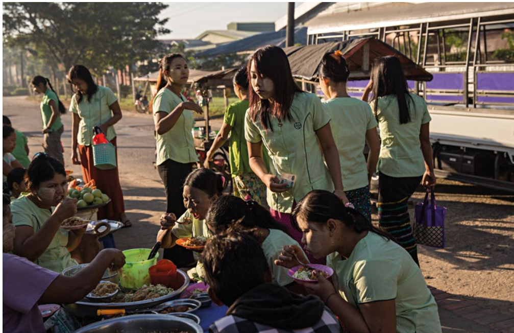
Garment workers eat breakfast at a small stand.