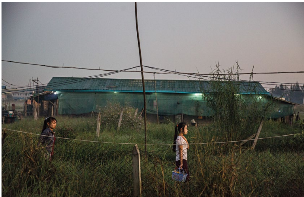
Garment factory workers walk down the footpath near their home on their way to work. Lauren DeCicca