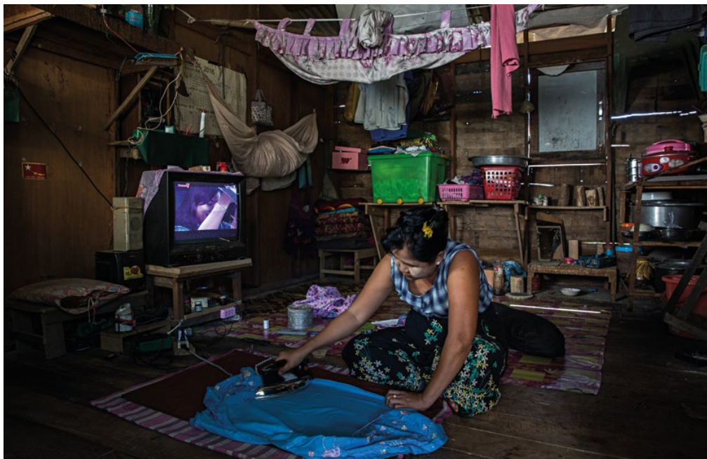
A woman irons clothes in her home.

Employers should, as a standard practice, conduct thorough age checks when hiring workers by checking their documents (NRC, township registration or birth certificate) and requiring a medical check. Young workers of 16-18 years old can only be employed with a valid CoF. Employers should be aware of unqualified medical bodies issuing forged certificates and NRCs. The employer should cover costs of CoF examinations. Buying companies, in turn, should be aware of their suppliers' administration and records being peppered with falsified documents.