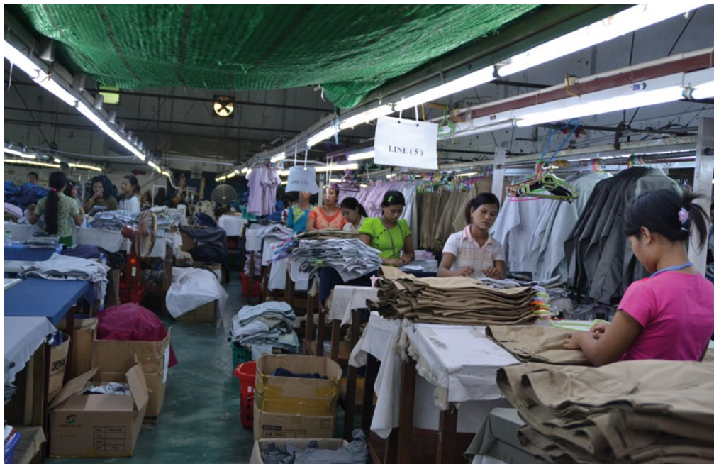
A garment factory in Myanmar (this factory was not included in the research).